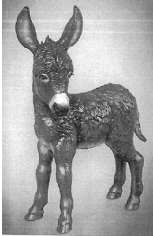
Sun and Four Inner Planets Francesca